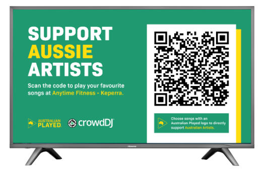
3. Digital signage with custom QR code generated by Nightlife

A digital signage slide with a custom Scan To Play QR code for your venue is available via the Advertising Library in the Manage My Nightlife web app.